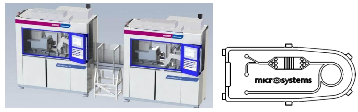
Fig. 1: Schematic image of 2C MicroPower and lab-on-a-chip drawing

Here, both the special micro-structured surface of the molded part and the coordination of the interacting machines and their robot systems by the control system are regarded as special challenges. The molds are supplied by Microsystems UK (Fig. 1).